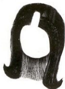
3D sketch of a NewHair™ wig

(2) To wear a NewHair™ wig, the wearer condenses @90% of his or her own real hair at the back of the head, typically using gel, hair pins, hair clips, corn rows, and mini French braids. The remaining @10% of the hair is deliberately left loose at the front of the head for brushing over the NewHair™ wig.