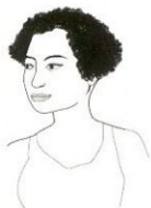
Wearer with her own hair prepared for a NewHair™ wig